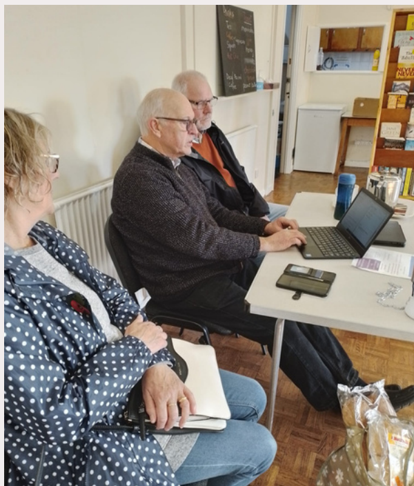
Photo left shows the previous winners from Q2, Kings Road Area Neighbourhood Watch in action!

Congratulations to Long Eaton & District 50+ Forum, who were the lucky winners of a free device in Q3's draw!